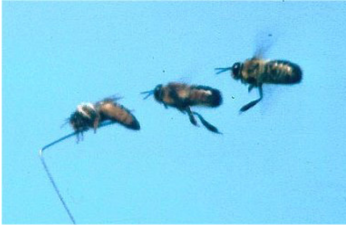
Figure 2. The second drone bows his hind legs to grasp his fellow drone.

overdosed with 9-oxodecenoic acid that is the honey bee sex attractant.